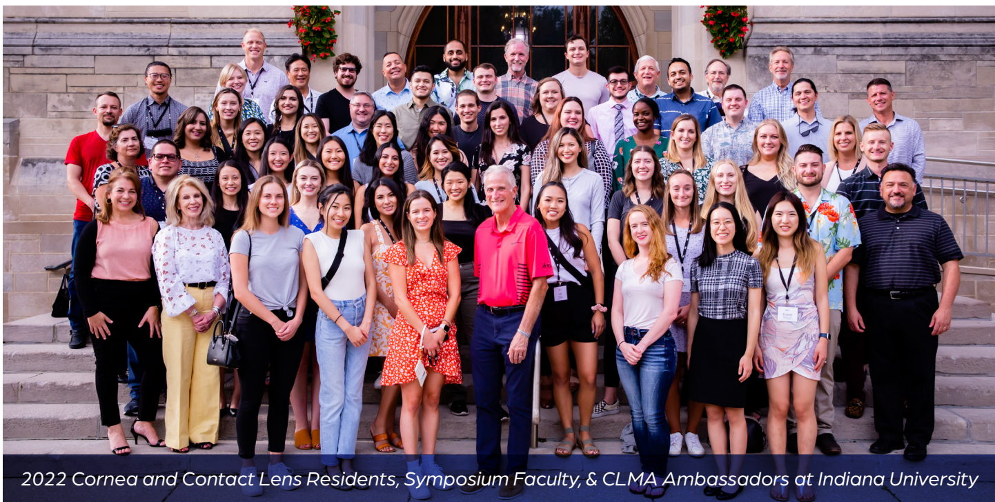
2022 Cornea and Contact Lens Residents, Symposium Faculty, & CLMA Ambassadors at Indiana University